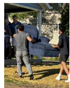
Young Afghan men carry furniture into the new house after the celebration.