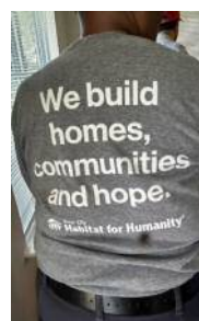
This shirt, worn by a Habitat for Humanity volunteer, says it all.