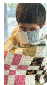
An Afghan boy wraps himself in the quilt he was given as a housewarming gift.